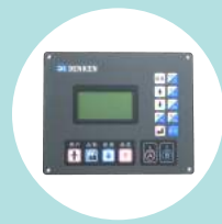
操作面板 LCD Panel