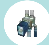
补水阀 Pumping Valve