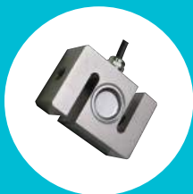
张力传感器 Tension Load Cell