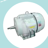
DENKEN - TOSHIBA 2.2 kW 2.8 kW 3.0-4.0 kW