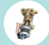
交换水阀 Change Valve