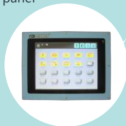
7寸触摸式面板 7 Inch Touch Panel