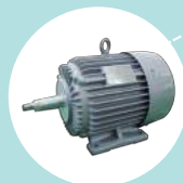
DENKEN - FUJI 2.2 kW 2.6 kW 3.0-5.0 kW